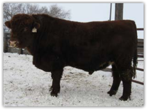
SASKVALLEY HAGGAED 271H