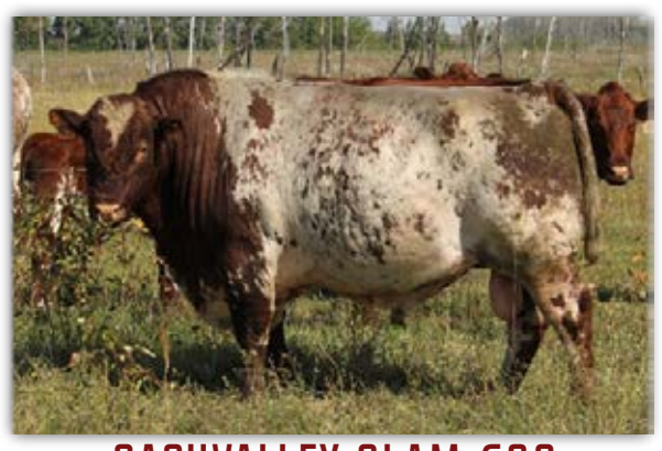
SASKVALLEY GLAM 68G