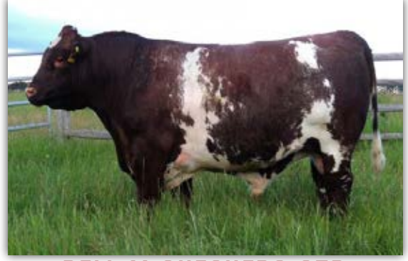
BELL M SKECHERS 87D