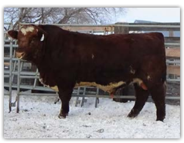
SASKVALLEY FLAGSTAFF 254F