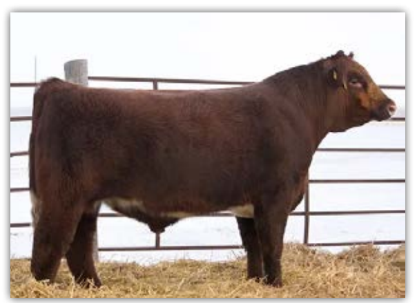
JSF WALL STREET 70E

Foundation Female of the "Princess" Family lots 1, 2 & 4