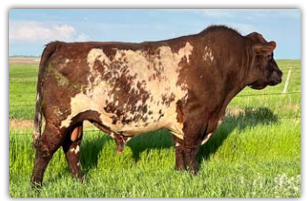
SASKVALLEY GENUINE 125G